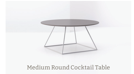
Medium Round Cocktail Table