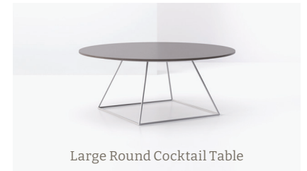
Large Round Cocktail Table