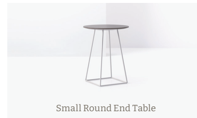
Small Round End Table