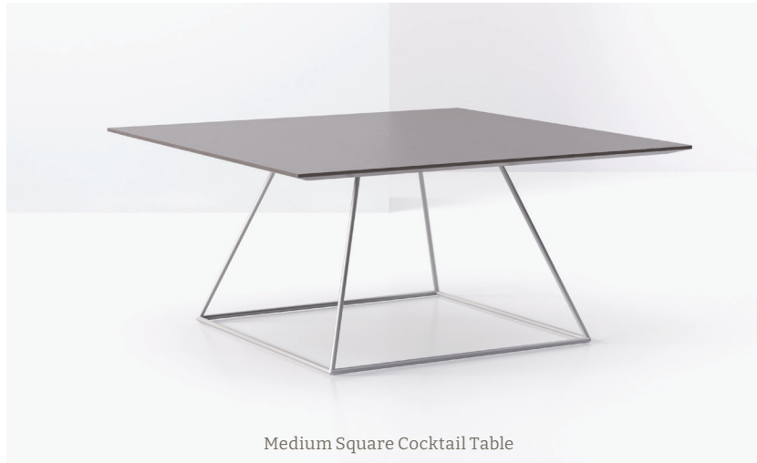
Medium Square Cocktail Table

Lightweight yet solid, Dayton end tables are easily pulled up for use as impromptu work surfaces. Cocktail tables impart an anchoring presence in seating groups, as they keep beverages, tech tools, books, and other items close at hand. Tops are available in Plural's exclusive palette of wood veneer, solid surface, and high-pressure laminate options. The table's steel-rod base is available in any of our 13 powder-coat finish colors.