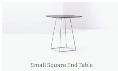
Small Square End Table