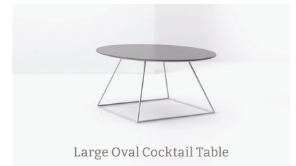
Large Oval Cocktail Table