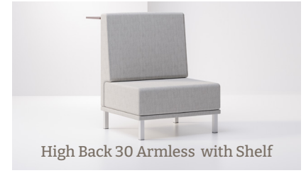
High Back 30 Armless with Shelf