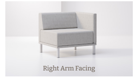
Right Arm Facing