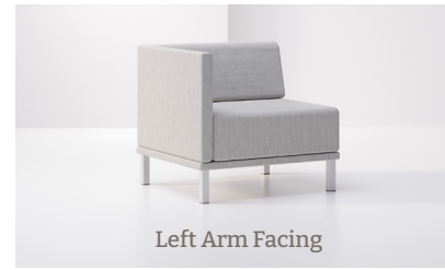
Left Arm Facing