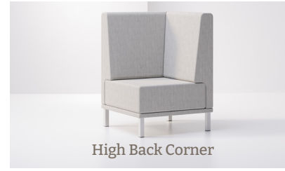
High Back Corner