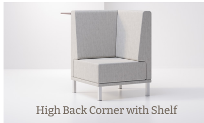
High Back Corner with Shelf