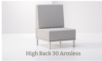
High Back 30 Armless